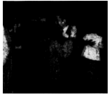
Manny Harmon's orchestra provided music for dancing.

Approximately 1,000 persons attended the Sunday evening opening mixer as well as the Wednesday evening banquet; attendance was