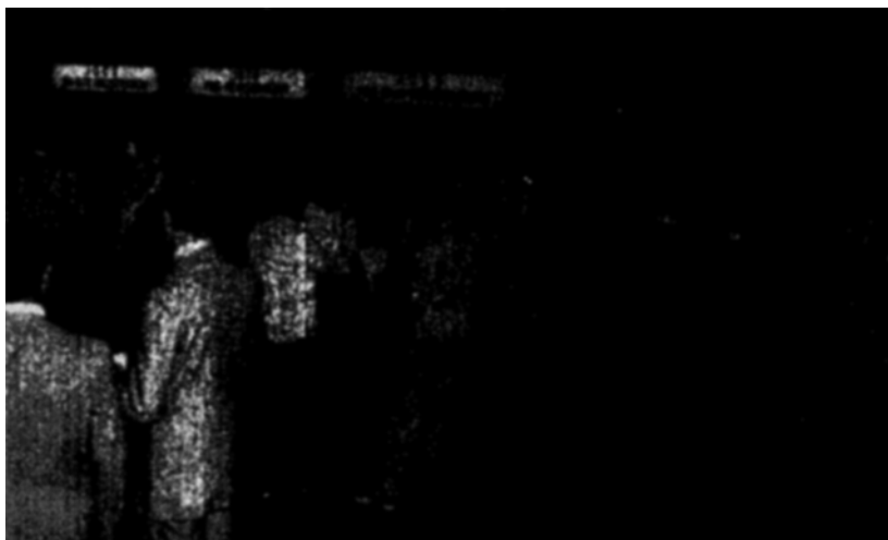
Sunday afternoon is busy time in registration area.

And, as if to emphasize that AOCS meetings are indeed earth-shaking events, a 4.8 earthquake rocked San Francisco a few days after the meeting had ended.