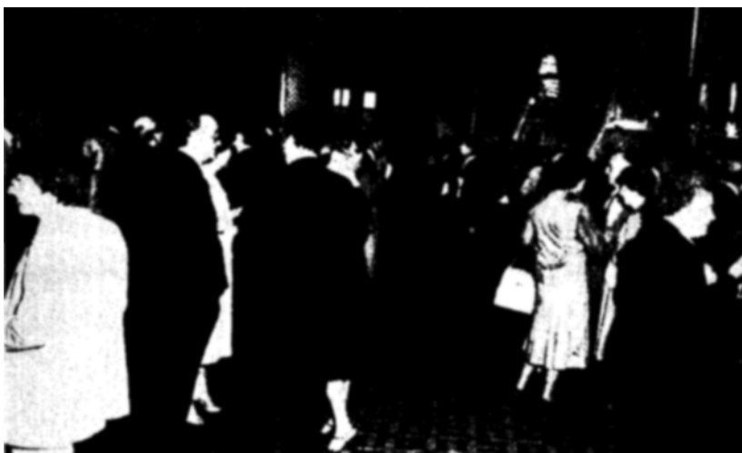
JOCS-AOCS reception Sunday.