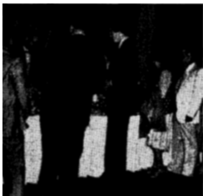
Wine-and-cheese mixer Sunday evening was first major social event.