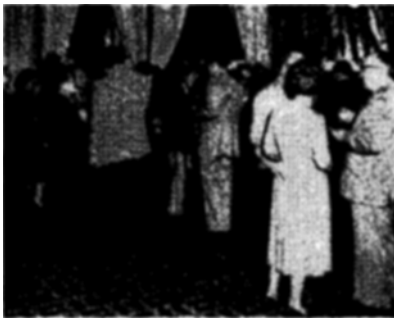
JOCS-AOCS special reception.