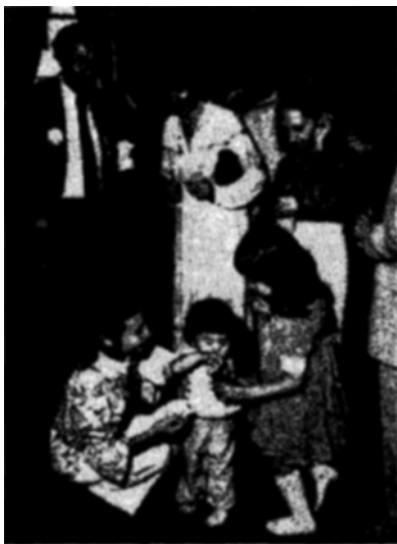
JOCS-AOCS reception Sunday found youngest attendee enjoying maraschino cherries.

Meeting social events were well attended. A special reception for Japanese Oil Chemists' Society members was held Sunday, April 29, just before the official opening mixer. A group of 60 JOCS members arrived in San Francisco Sunday afternoon. JOCS representatives also extended an invitation to AOCS to participate in a third joint meeting of the two societies.